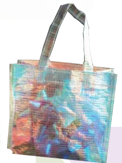
貼合網布 By laminated to fabric