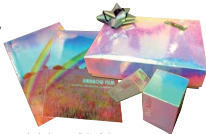
貼合紙張或紙板 By laminated to paper or paperboard