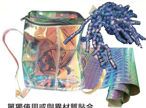
單獨使用或與異材質貼合 By itself or in a transparent lamination